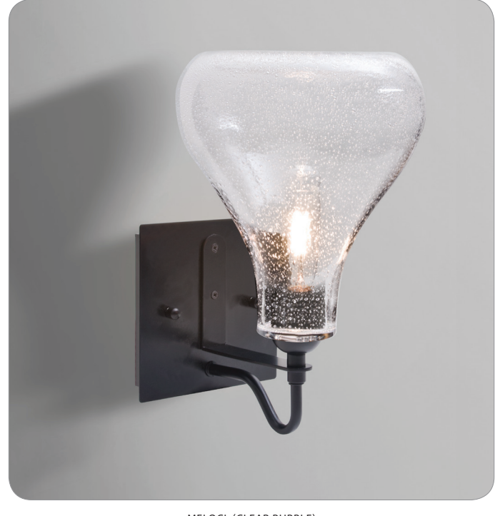
MELOCL (CLEAR BUBBLE)